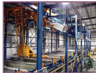
Turn-key coating lines may include multiple hoists, process tanks, in-line dryers, and automated load and unload equipment such as tote box dumpers, vibratory feeders, and automatic barrel cover handling devices.

The best-designed machines accomplish this through use of commercially available components, minimizing the need for made-to-order (MTO) components wherever possible. A machine-specific perishable components list should accompany every machine installation.