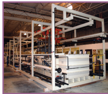
Modularization offers an approximate 50% reduction in installation time on the production floor, usually costs less than build-on-site systems, and is typically of higher quality.

The speed and quality of installation can make an enormous difference where production must be maintained. Modularization offers about a 50% reduction in installation time