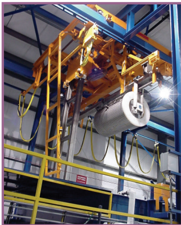
Barrel processing operations offer finishers many benefits, particularly as it relates to the application of labor. Here, the only operator is a forklift driver.